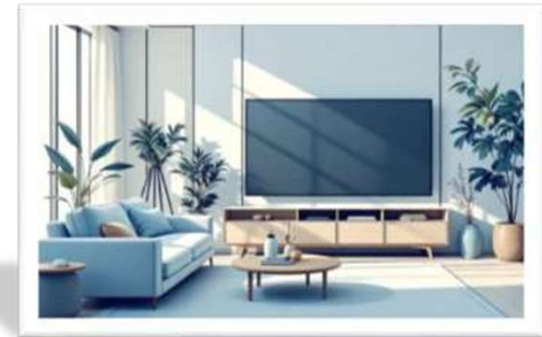
Furniture F Home Appliances

Supporting seamless inventory movement and customer deliveries.