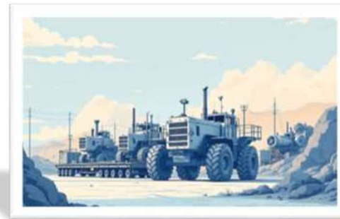
Oversized Product Businesses

Secure transportation of sensitive and oversized electronics.